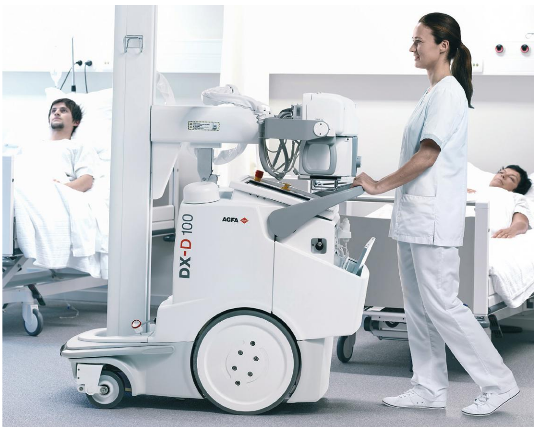
Fast image capture at patient's bedside. The system incorporates the fully integrated NX acquisition workstation touch screen.

Make sure hands and the touch screen are dry before utilizing the touch screen. Excess moisture may affect the behavior of the capacitive touch screen. The operator always should verify the selected parameters and settings before making an exposure.