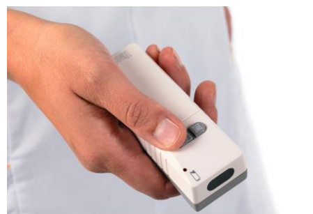
Remote control and handheld switches allow you to remain close to your patient during image capture.

DX-D 100 + : Wireless - Mobile - Maneuverable - Motorized